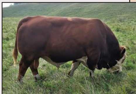
Sibelle Arthur 39B

Use this bull, like his brothers, for ease of calving and to create herd-building females.