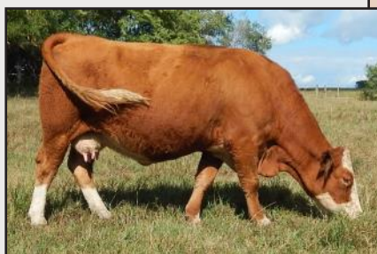
S/M Hermione U482

F462 is super long and very attractive. Sired by Anchor T Legend 7H, a sire that we use for his calving ease and his daughters. Use him to create females. Polled, and look at these EPDs.