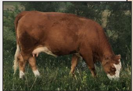
S/M Franchesca B141

Balanced top-ranking EPD's in the top 10% for ALL these traits. Use him for power, and keep every daughter.