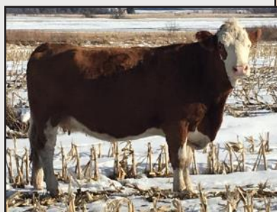
S/M Addie C551

His young polled dam, S/M Addie C551 is a maternal sister to the two-year-old bull that we retained and used here last year, S/M Epic E581.